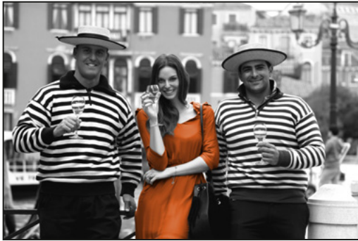
Ragazza e gondolieri

Orange is the iconic colour of the brand hero Mionetto Prosecco DOC Treviso Brut with the orange label.